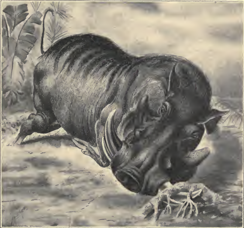
FIG. VII. MACROCEPHALUS AFRICANUS. WART HOG.

Phacochoerus africanus Elliot, Pub. Field Columb. Mus., 1, 1897, p. 109. Zoöl. Ser.